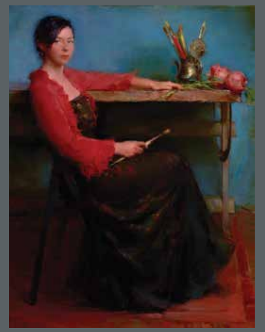
Olga Krimon, Self-Portrait with Peonies Oil on Belgian Linen | 36 x 48 inches