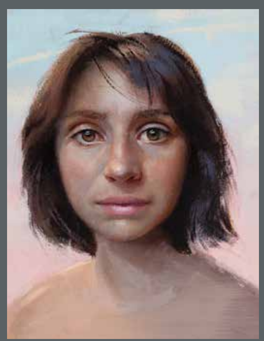
Andrea Kemp, Airplanes Oil on Paper | 13 x 13 inches