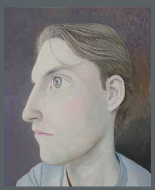
Travis Collinson, Study for the Blue Rider Acrylic on Linen | 15 x 13 inches