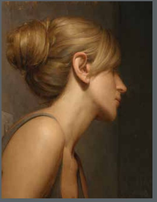
Carla Crawford, Half Light (detail) Oil on Linen | 19 x 14 inches