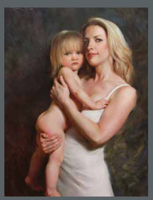
Anna Rose Bain, Motherhood (detail) Oil on Linen | 30 x 20 inches