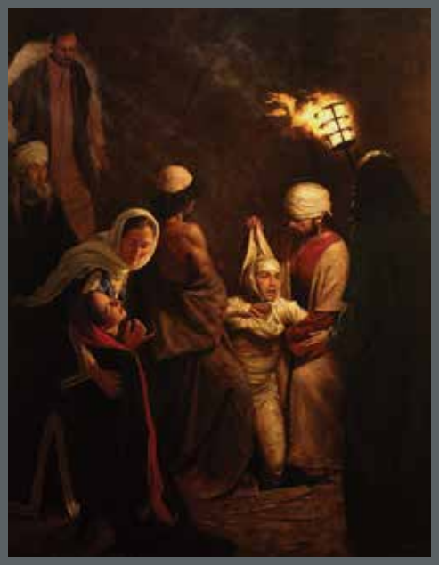
Jeff Hein, Raising of Lazarus Oil on Canvas | 96 x 72 inches