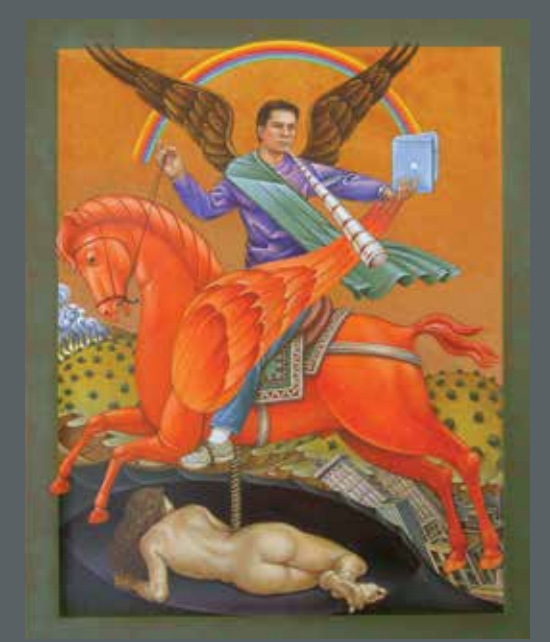
Michael Bergt, St. Michael of The Apocalypse Egg Tempera | 17 x 13 inches