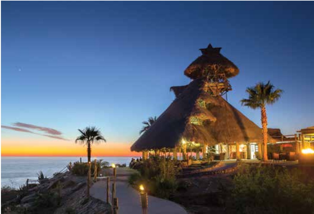
Guaycura Boutique Hotel, Beach Club & Spa