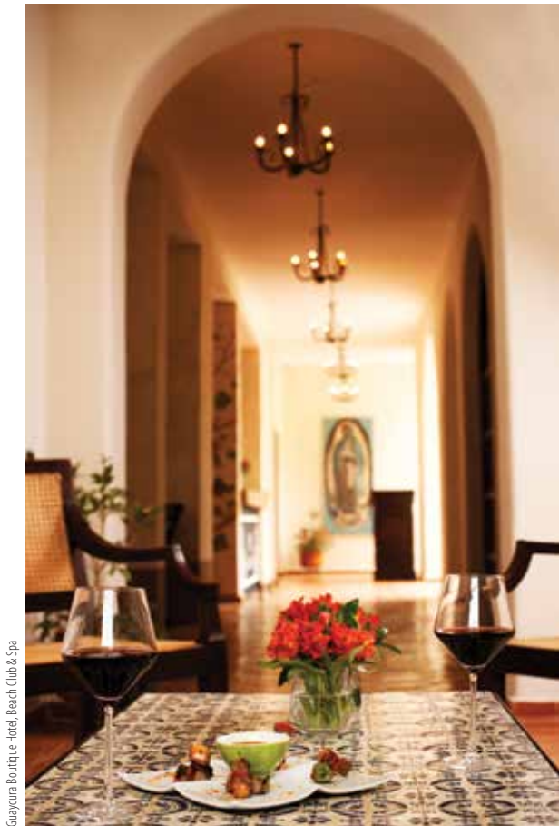
Guaycura Boutique Hotel, Beach Club & Spa