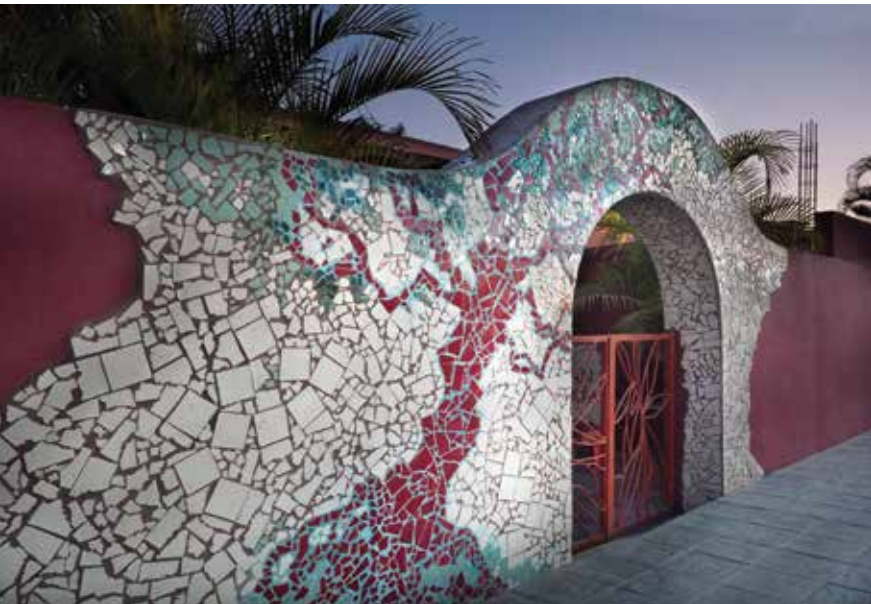
Galería Logan features artfully designed broken-tile murals, garden settings and contemporary paintings.

perfectly mild to hot due to Pacific Ocean breezes, but most restaurants, shops and galleries remain open. It's wise to give Baja a pass from August through October, as it is hurricane season and weather can be unpredictable.