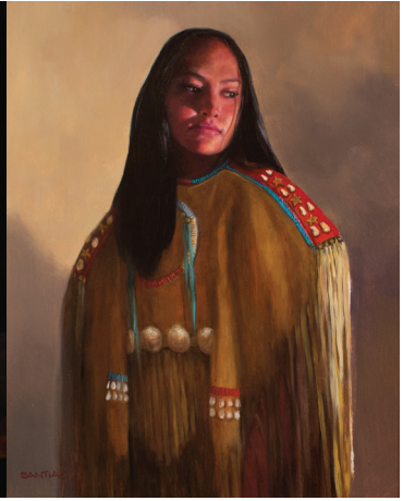
The Ancient, oil on canvas, 48"h x 48"w