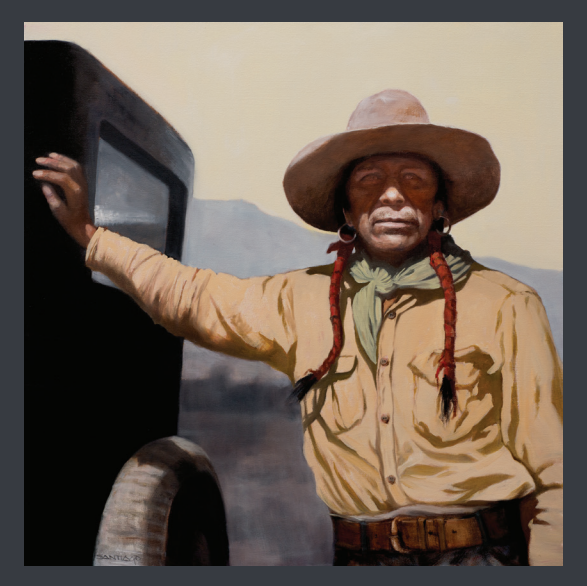
Waitin' on Juanito, oil on canvas, 36" h x 36" w (detail on the cover)